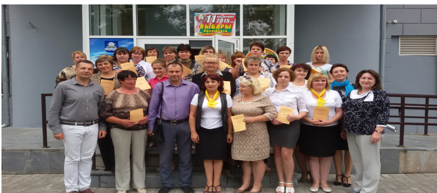
At photo: Seminar for social workers in Navapolatsk, Vitebsk Region

The Belarusian Republican Gerontological Public Association started the project which is dedicated to the education of social workers in the field of primary medical knowledge in geriatric medicine. According to this project, the serial seminars were held in different regions of the Republic of Belarus. Problems such as revealing and management of frailty, cognitive impairment, pressure ulcers, falls and other geriatric syndromes in measures of the competence of social workers were discussed. The project will help to introduce a team approach and close cooperation between medical and social workers in the management of elders with geriatric syndromes who live in community and nursing homes. The scientific curator of project is Vice-President of the Belarusian Association of Gerontology and Geriatrics ,Professor Kiryl Prashchayeu.