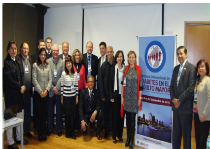
“Diabetes Consensus Group in the elderly in Latin American”